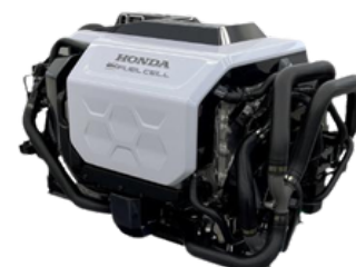
Honda Fuel Cell

Total Hydrogen Solutions is pioneering the future of clean energy with leading hydrogen fuel cell technology, transforming power sources for vehicles and machinery. Our expertise in storage (gaseous and solid), fuel cell and battery integration, EV charging, and containerization, enables us to provide solutions for FC backup power, hydrogen for electrification and hydrogen blending.