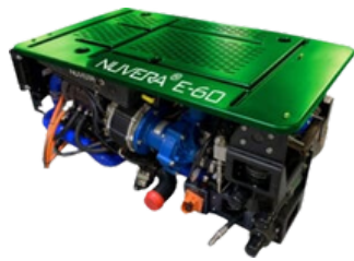
Nuvera Fuel Cell

Total Hydrogen Solutions is pioneering the future of clean energy with leading hydrogen fuel cell technology, transforming power sources for vehicles and machinery. Our expertise in storage (gaseous and solid), fuel cell and battery integration, EV charging, and containerization enables us to provide solutions for FC backup power, hydrogen for electrification (i.e., EV charging), and hydrogen blending.